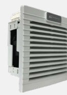
4. Close Grille