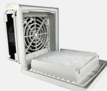
3. Insert Filter