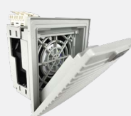
1. Open Grille