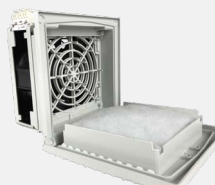
3. Insert Filter