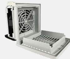
2. Remove Filter