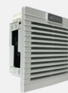
4. Close Grille